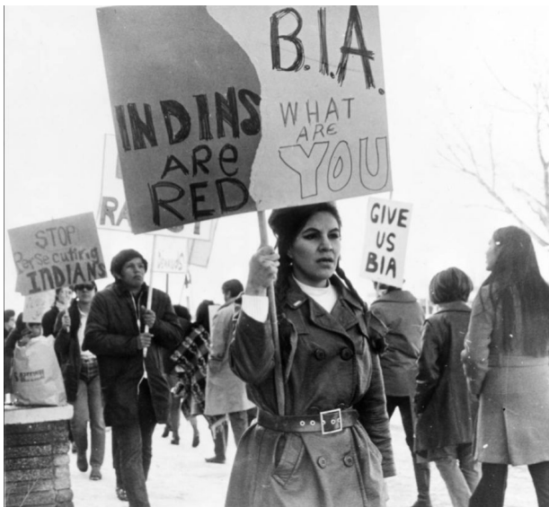
Native American men and women walk a picket line to protest perceived discrimination by the Bureau of Indian Affairs. Signs read: "Indians [sic] are red, B. I. A. what are you," "Stop persecuting Indians," and, "Give us BIA." (1970s)