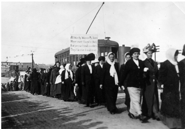
Women march in support of UMW coal miners on strike against CF&I in Trinidad, Las Animas County, Colorado; they carry a sign: "All Worthy Women My Sisters Have Ever Found It Thus If We Are True Friends To Others They'll Be True Friends To Us." (1913)