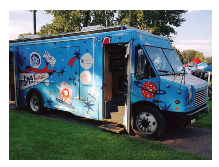
Denver Public Library's Reading Rocket

In 1969, an issue of the West Side Recorder, a monthly West Denver newspaper, highlighted the bookmobile's summer schedule in the neighborhood. The paper refers to the vehicle as, "A Special Bookmobile - 'El Numero Cinco."" The stops specifically focused on providing Spanish language books and family friendly programs. The article also mentions fines: "The overdue charge for materials from bookmobiles is five cents per week." This is roughly $.39 in today's economy. Luckily, DPL eliminated overdue fines in 2019.