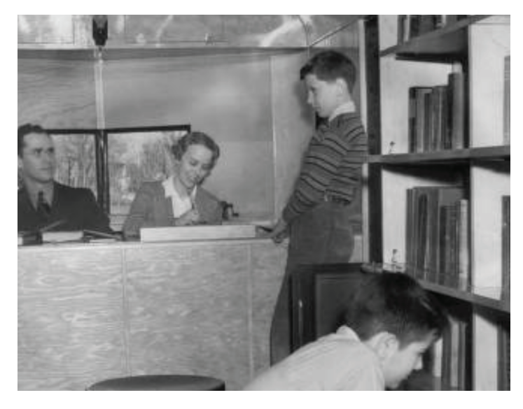
"A rubber-tired library"

Each year the American Library Association (ALA) celebrates National Library Outreach Day to recognize bookmobiles and library workers across the country who provide library access and outreach to their communities. The Denver